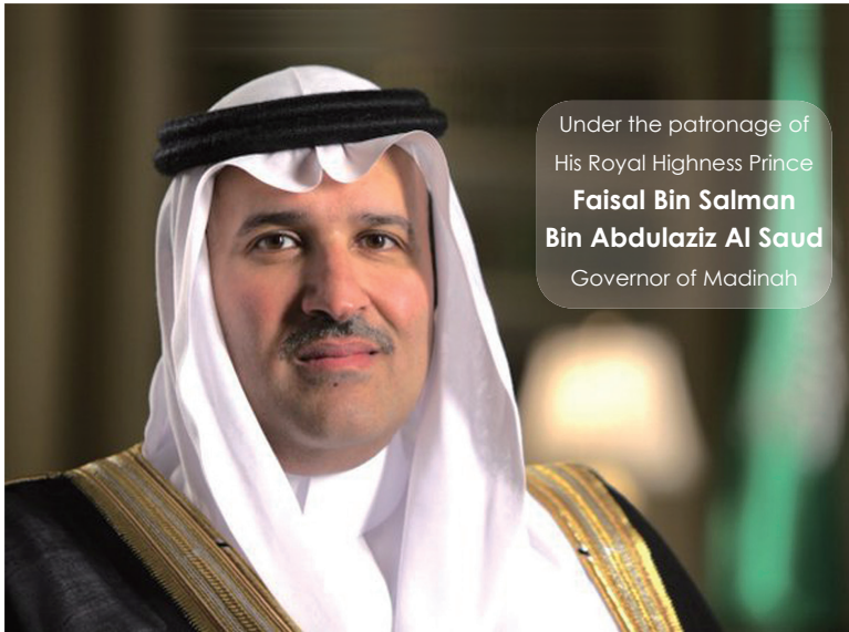
Under the patronage of His Royal Highness Prince Faisal Bin Salman Bin Abdulaziz Al Saud Governor of Madinah

96% PALM participants recommend the program as an excellent investment