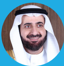
H.E. Dr. Tawfeek AlRabeah Minister of Health, Kingdom of Saudi Arabia.

Today, the focus in healthcare sector is more specific towards facing industry main challenges; patient-centered care, improving clinical outcomes, implementing health digital technology solutions, product innovation and transformation. These challenges will require new strategies on the part of governments and private healthcare players who need to constantly redesign care processes in order to improve quality.