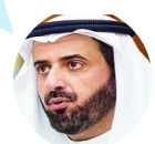
H.E. Dr. Tawfeek AlRabeah Minister of Health Kingdom of Saudi Arabia

“I am very pleased to join this course, have learned a lot and found this course very interesting. The quality of the global speakers, participants and the interaction with them was a great help for me to learn more. The mix of program activities, case studies and Q&A has helped me in the arena of leadership and decision making Having a great education in a great place like Madinah is the best one can hope for.”