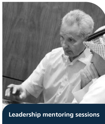
Leadership mentoring sessions