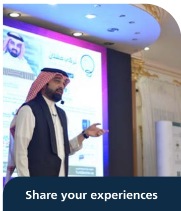
Share your experiences