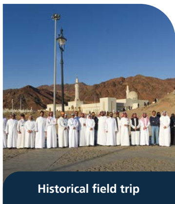
Historical field trip