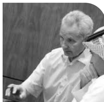
Leadership mentoring sessions