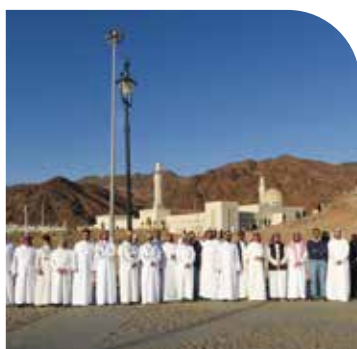
Historical field trip