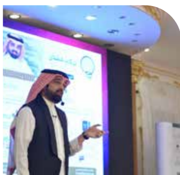
Share your experiences